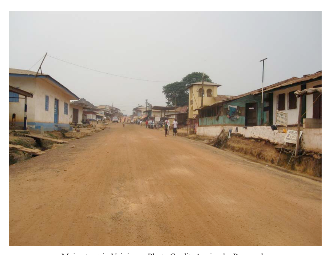
Main street in Voinjama.