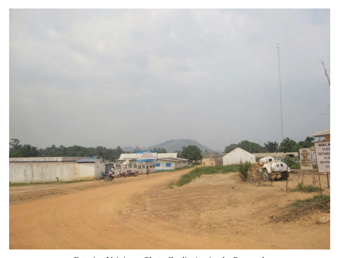
Entering Voinjama.