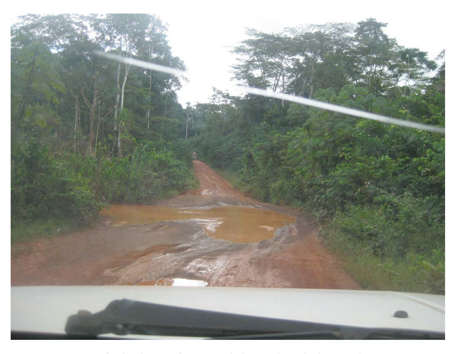
After the rain on a Lofa County road.