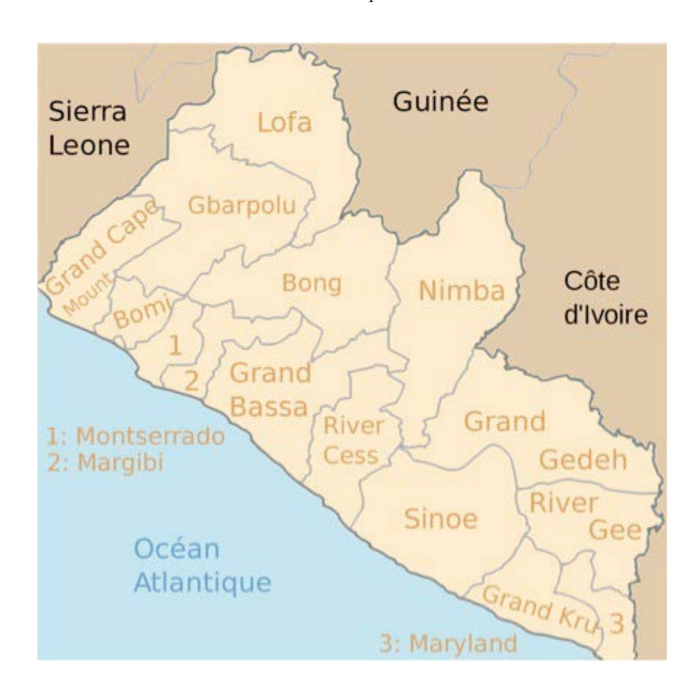
Map of Liberia