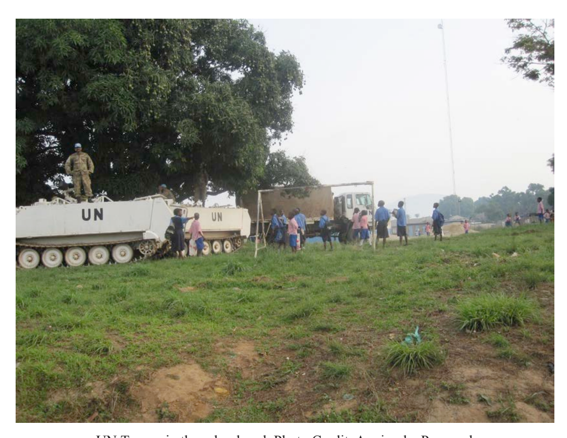
UN Troops in the schoolyard.