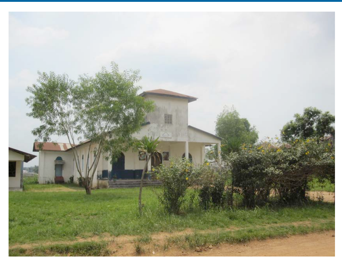
Christian church.