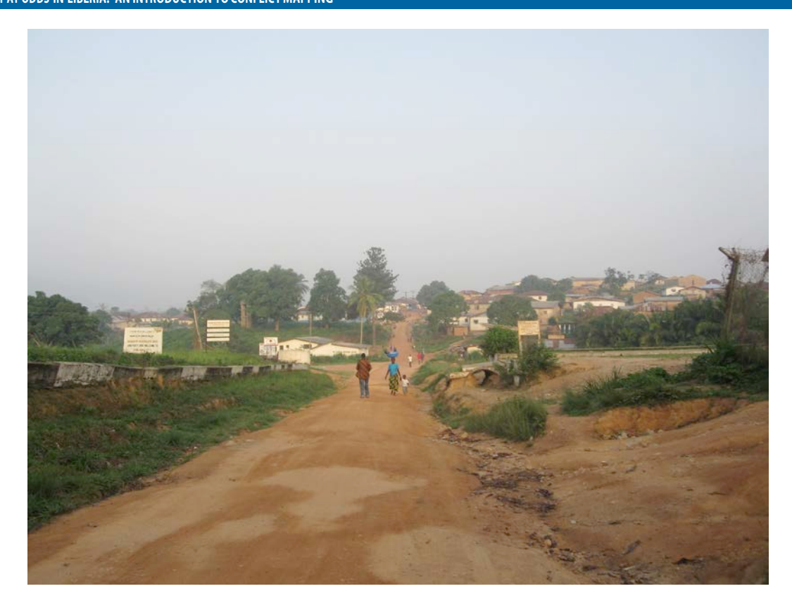
Road into Voinjama.