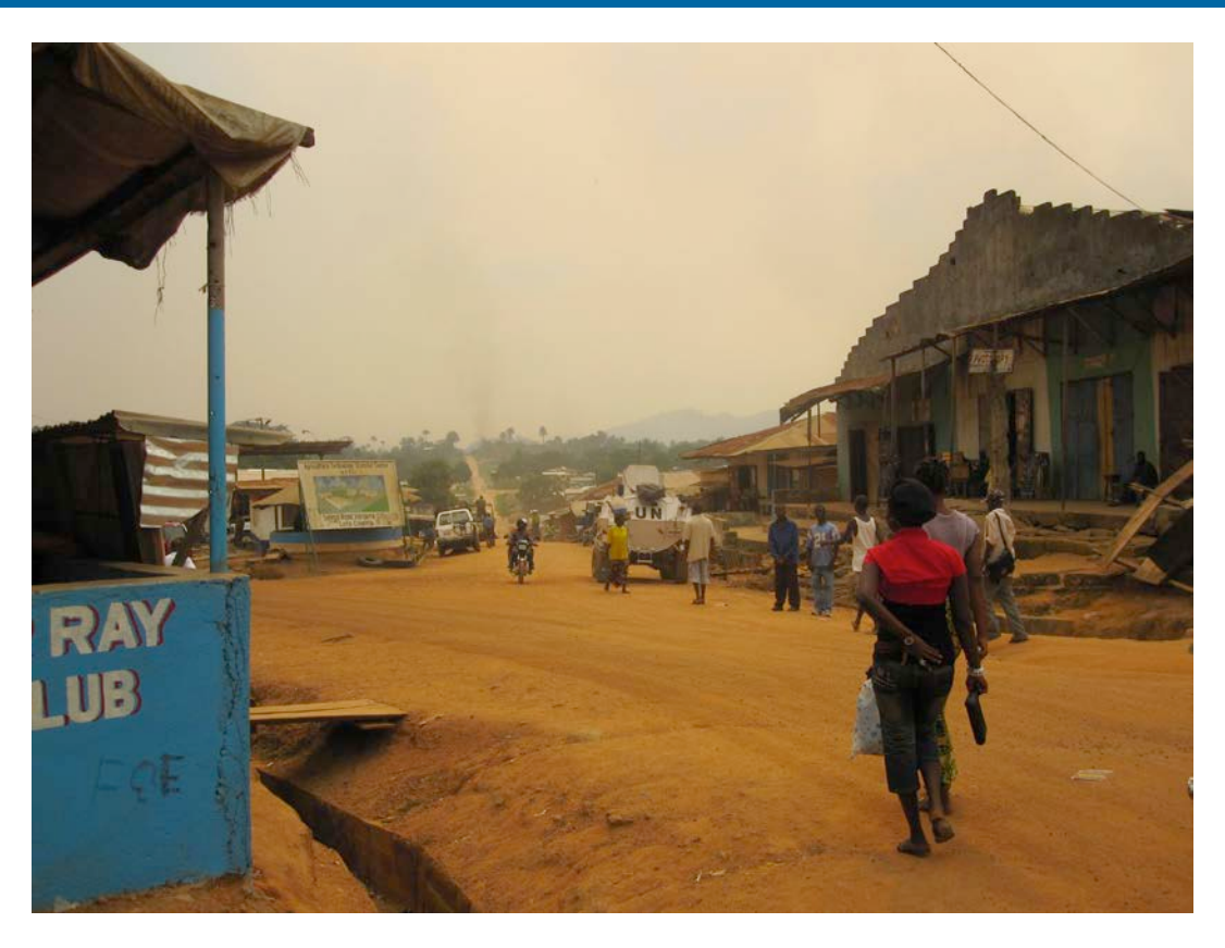
Central intersection in Voinjama.