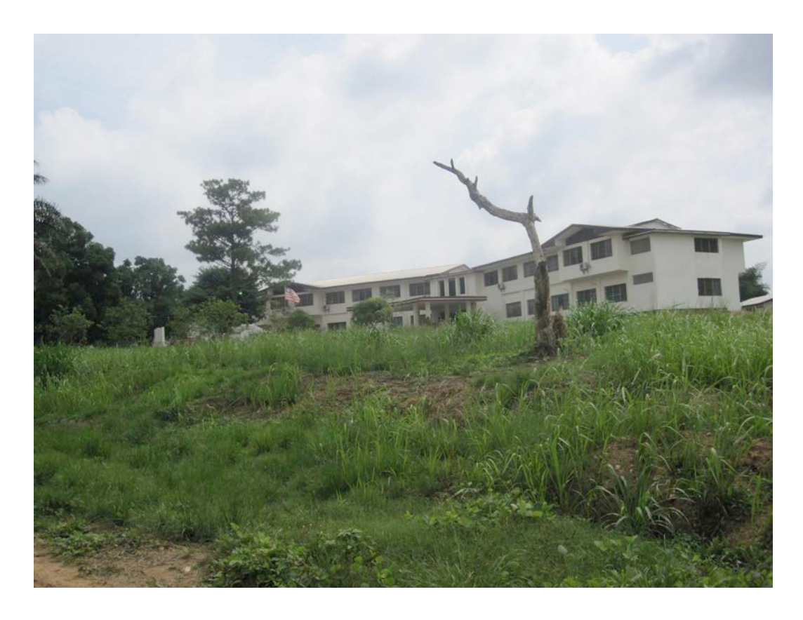
Lofa County government building.